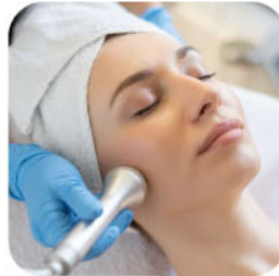
After medical aesthetic procedures