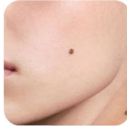
After wart/mole removal